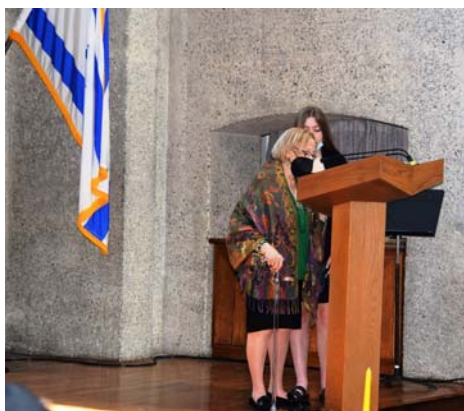
Above: Outside and inside the Chapel