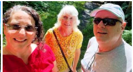
Above— June walk in Highpoint State Park. Left— July walk at the Delaware River where NY, NJ and PA intersect.