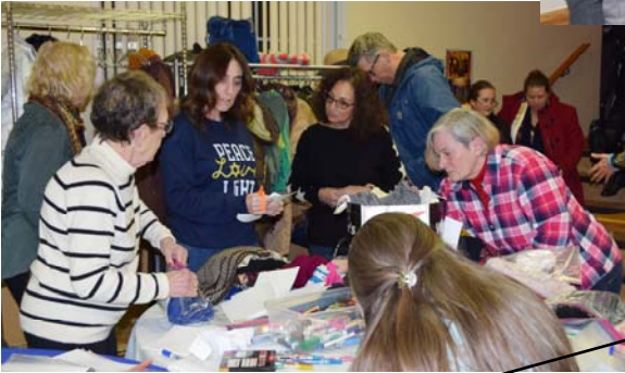
Donated scarves and gloves